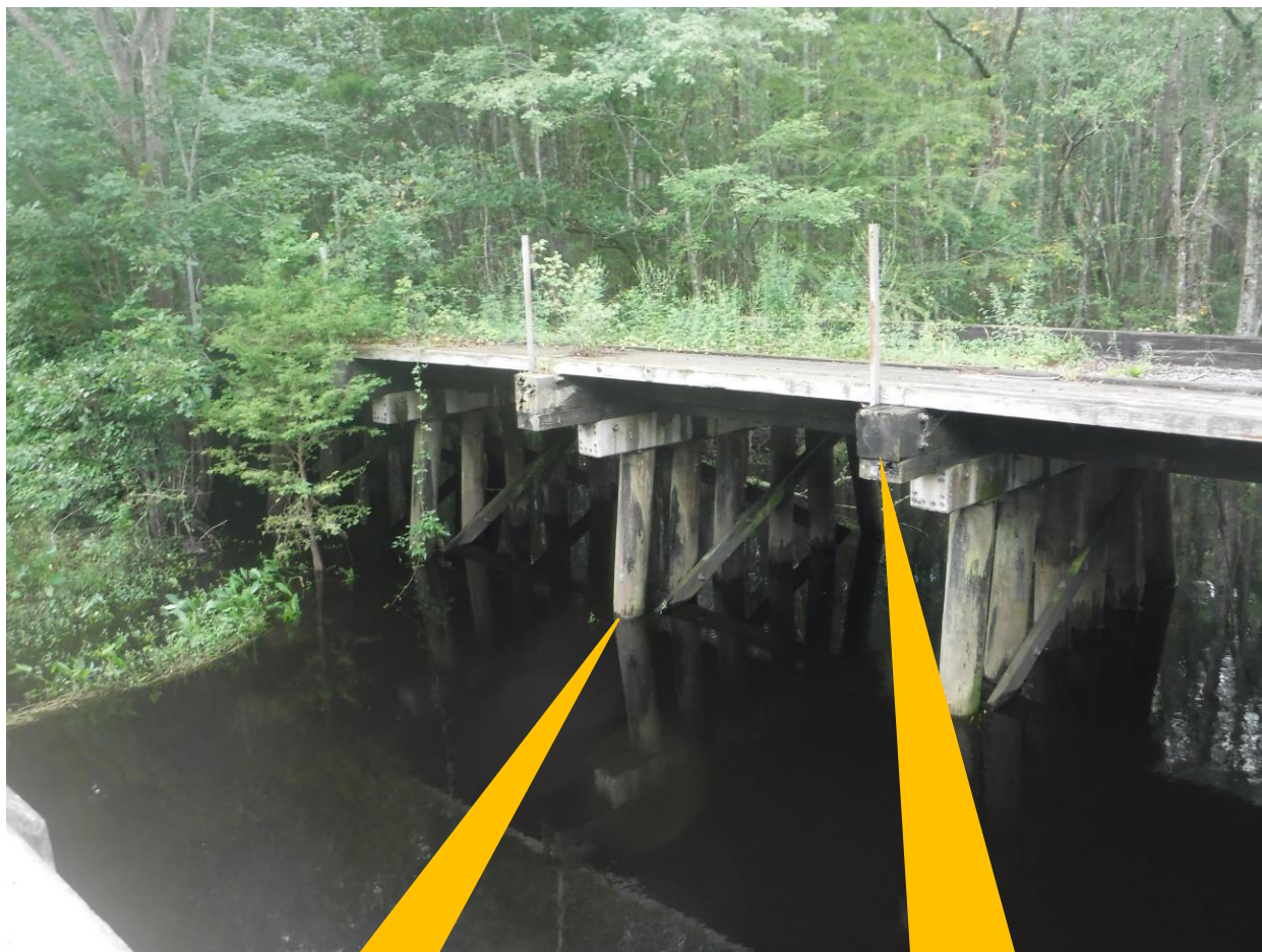
Typical Bent Section Spaced at Approx 12" O.C.