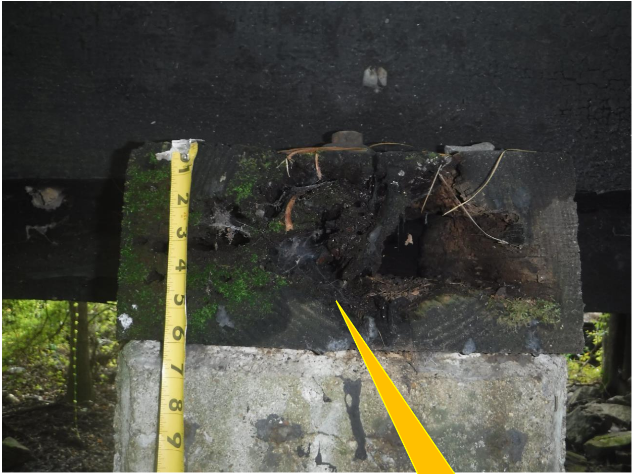
Partially Rotten Support for Side Rail, Opposite Side from Hwy 303